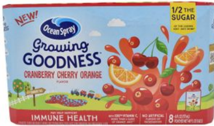
“1/2 the sugar“

As consumers' desire for less sugar and clean label drinks increases, beverage manufacturers are rising to the challenge.