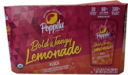
“Bold on Citrus not on Sugar“

Ocean Spray Growing Goodness Cranberry Cherry Orange Juice supports immune health and contains 1/2 the sugar , with 130% of vitamin C, more than a glass of orange juice. (US)